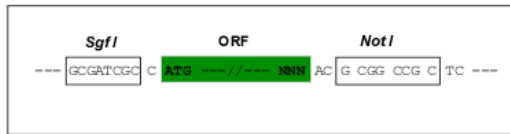
Cloning sites used for ORF Shuttling: