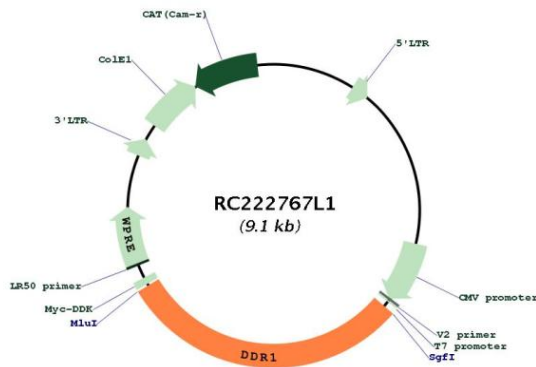
Circular map for RC222767L1