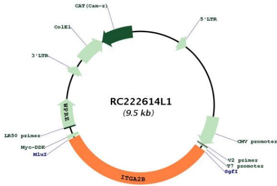
Circular map for RC222614L1