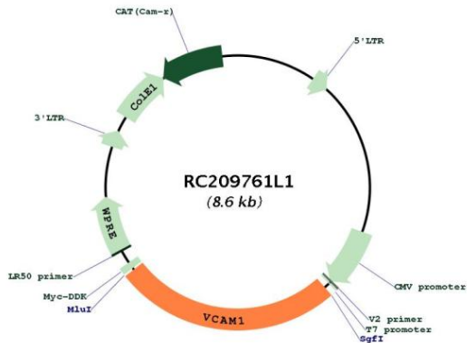
Circular map for RC209761L1