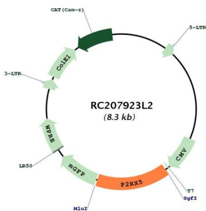
Circular map for RC207923L2