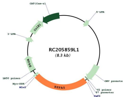
Circular map for RC205859L1