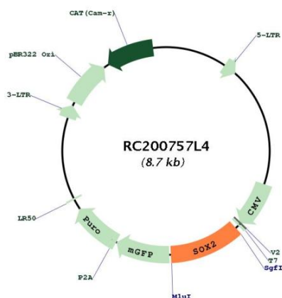
Circular map for RC200757L4