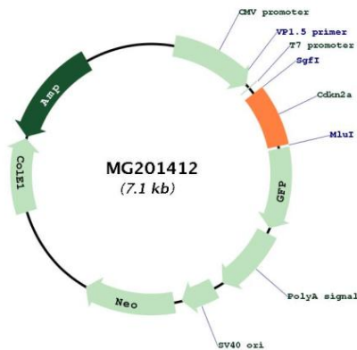
Circular map for MG201412