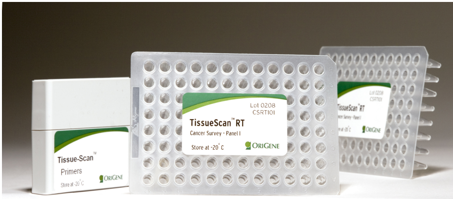
TissueScan product image.