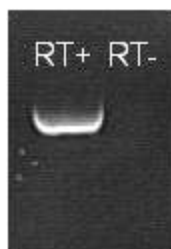
RNA RT-PCR Image