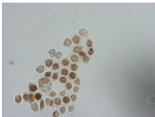
Immunocytochemistry staining of HT-29 cells pulsed with 5-bromo-2'-deoxyuridine (BrdU) using mouse monoclonal antibody