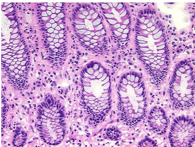
DNA - 20x.