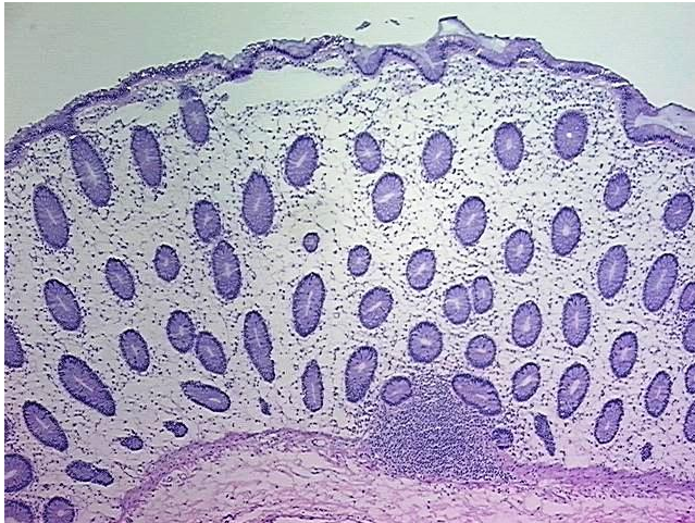
DNA - 4x.